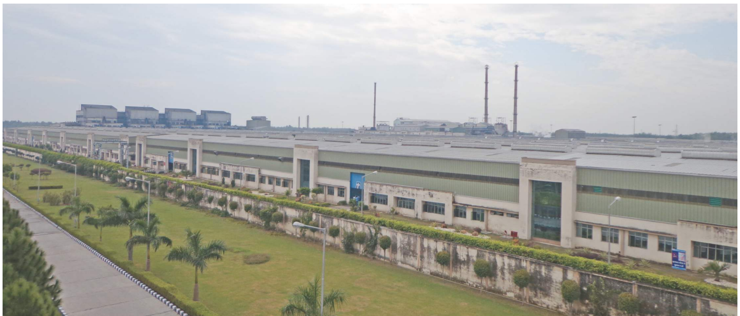
A view of the Laksar Plant